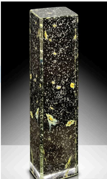
Yellow Step Flowers